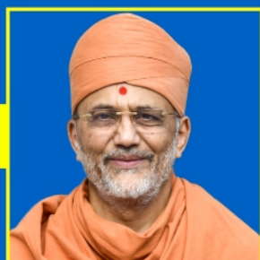
P.P. TYAGVALLABH SWAMIJI